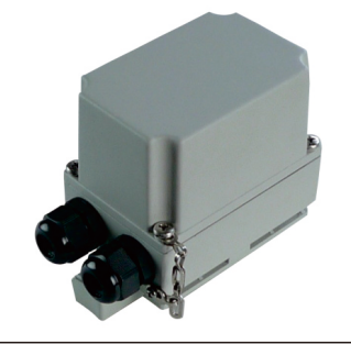
Y108L: Internal manual reset (Without pilot light)